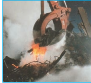
World Trade Center area, New York

Not hit by an airplane, the 47-story WTC7 collapsed at 5:30 pm into its own footprint in approximately six seconds. WTC7 is not mentioned in The 9/11 Commission Report.